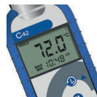
Max/Min feature recalls highest and lowest reading