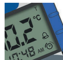
Count-down timer and alarms