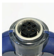
Secure Lumberg Connector