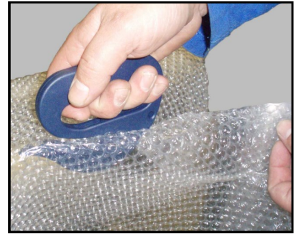
Bubble / Stretch / Shrink Wrap