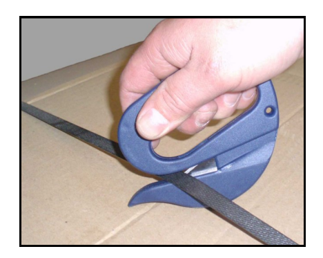
Strapping / Banding