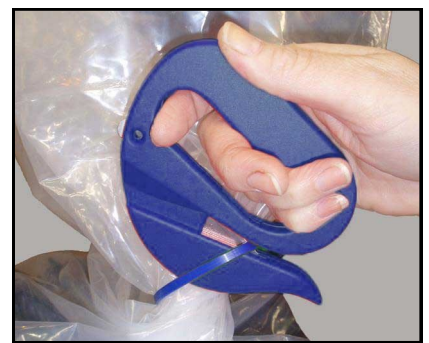
Cable Ties / String

The disposable Swan Safety Knife is an ideal bag/ sack cutter. With it's pointed nose to puncture into material, 'opposing slopes' at the blade exit for a more efficient cut and tape cutter located at the side of the knife, this is an excellent general warehouse cutter. Moulded in a Metal Detectable plastic with Stainless Steel blade and tape cutter.