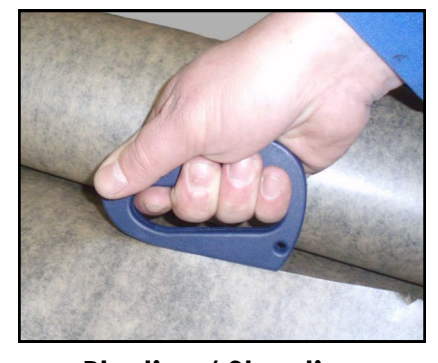
Plastics / Sheeting