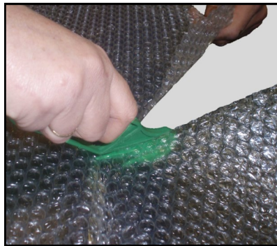
Bubble / Shrink / Stretch Wrap