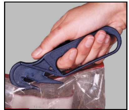
Plastic Bags / Sheeting

Please test all detectable products with YOUR detection equipment prior to use