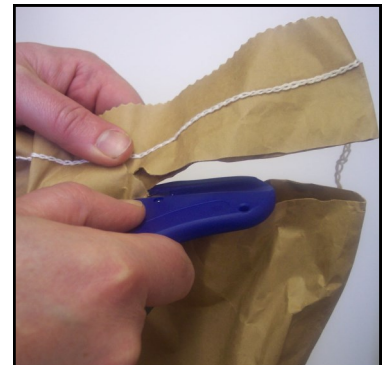
Bags / Sacks