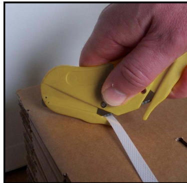
Strapping / Banding