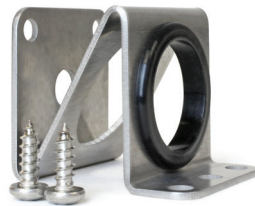
Table Surface Style

The MultiMount-Z is a versatile mount or stand for use with the HiTemp140 series of data loggers. It can be used to stabilize a logger inside an autoclave, or screwed to a flat surface to create an anchored base. Made of 316 Stainless Steel, the MultiMount-Z is able to withstand temperatures up to 150 °C making it ideal for use in autoclave sterilization processes.