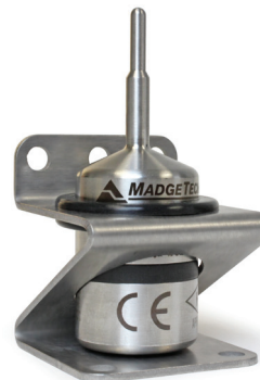
Wall Mount Stand Style with a Temp1000IS