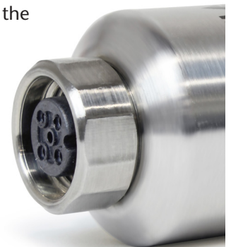
Closeup of the M12 Connector