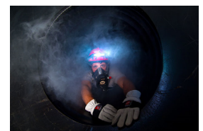
Flammable and/or explosive atmospheres

A world leader in digital thermometers, Rototherm has become the standard for accurate and reliable measurement across the following industries: