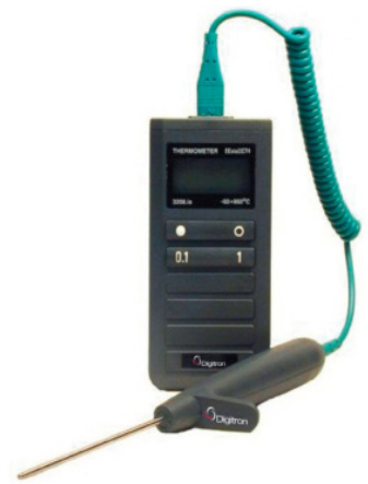
3208 IS Model

For other options, please contact us digitronsales@rototherm.co.uk or +44 (0)1656 740551